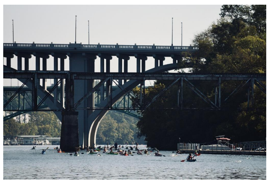
Navigating Train Bridge #1 and the Henley Street Bridge at Bridges to Bluffs, 2019.

added 25 slots this year and, once again, sold out. Hobbs Island will be dual-sanctioned next year, by both USMS and USA Swimming, with 1, 2, and 5 mile events. So, save the date (September 20, 2020). As of 2018, the Directors of the three longest open water events that take place on the Tennessee River, created the "Triple Crown of Tennessee". Have you achieved a Triple Crown award?